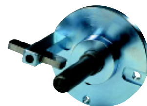
External skiving tool