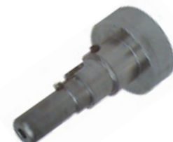
Internal skiving tool